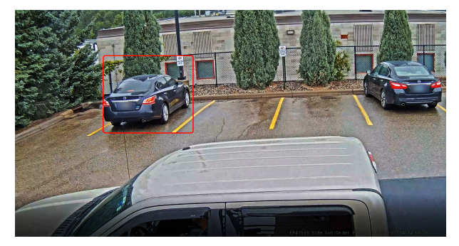
The "Stopped Vehicle" analytic triggers an alert when a vehicle pulls into a parking space for curbside pickup.

Rugged 6MP IR dome with built-in video intelligence and HDR technology